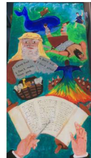
People of God